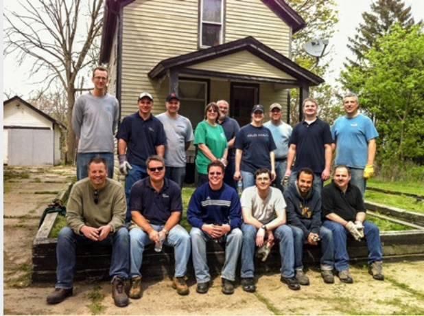
Patti Engineering's team of volunteers help Grace Centers of Hope to rebuild Pontiac!

Click here to read the rest of the story.