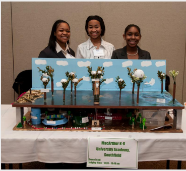
MacArthur K-8 University Academy wins "Best Use of Automation Technology"

philanthropy, volunteerism and leadership. Additionally, as a company we donate to various charities throughout the year.