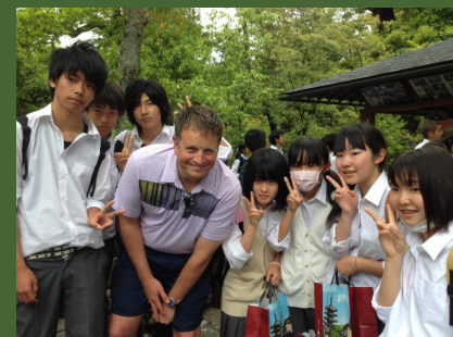
Japanese school children practicing their English!