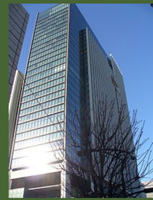
Mitsubishi Corporate Headquarters

Patti Engineering has strong relationships with our partners, and we pride ourselves on having expert knowledge on each partner's technology and products. Mitsubishi Electric Automation, Inc. is among the top three automation suppliers globally and an important partner to Patti Engineering. Mitsubishi recently rewarded Patti Engineering for our performance and dedication with an invitation to Mitsubishi Electric Corporation Headquarters in Tokyo, Japan.