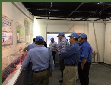
Mitsubishi Factory Review